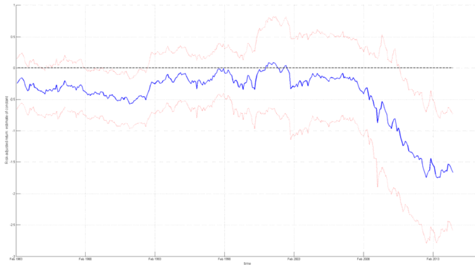
Figure 1: Time series of risk adjusted excess return on the stock index of the German banking sector (in % per month)

Notes: The time series of the risk-adjusted excess return on the German banking sector index is obtained from 120-month rolling window regressions over the sample period from February 1973 to June 2014. The blue solid line depicts the point estimates of the risk adjusted return and the red, dotted lines are the point estimates \pm two standard errors to indicate the uncertainty surrounding the estimate. The dashed black line indicates a risk-adjusted return level of zero.